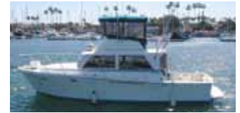
38' Uniflite '77. Twin 671 Detroit diesels. Boat has topside blisters but at $45,000 asking price, she is a lot of value.