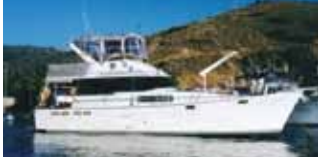
38' Bayliners. 2 available. 1984 @ $39,900. 1990 @ $79,500.