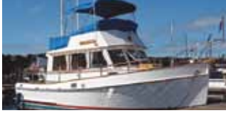
32' Grand Banks. 2 available. These timeless classics are great values in cruising. From $33,000.