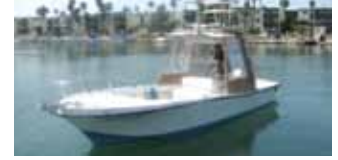
23' Mako. Inboard straight drive. New ('04) 320hp Volvo. Tower with enclosures. Bait systems, color fatho, new GPS chart plotter, stereo, windlass. Dealer owned, priced to sell. $16,500.

Please check our website for many more listings: www.flyingcloudyachts.com