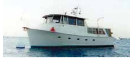
47' Kenny Hill Trawler '70. 671 Detroit with 230 hours SMOH. Stabilizers, stern thruster. Beautiful! $110,000.