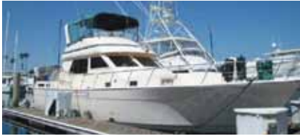
48' Angel '85. Low hours on 3208 Caterpillar diesels. 8kw generator. Recently remodeled. Great layout and large engine room. $189,000.