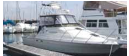
29' Luhrs '86. Great fish/dive Catalina boat. Tower with controls, well kept, fresh Crusaders, bait systems, outriggers. Owner has new boat. Very clean. $24,900.