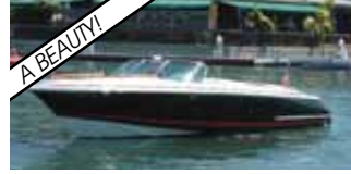
25' Chris Craft Corsair '04. Only 150 hours on 420hp Volvo. Does 55 mph. Dual exhaust. Black hull w/deluxe accessory package. Includes HydroHoist. $54,900.