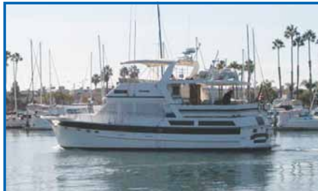
48' Jefferson Sundeck MY '87. Twin 3208 Caterpillars, NAIAD STABILIZERS, AC/heat, full 19 cu. ft. refer/freezer. 12V dinghy davit on sundeck cover and new Johnson davit on bow. Tons of electronics. She has one of the nicest engine rooms you can hope to find. 2 staterooms and office/den. Recent haul and survey. This is a great buy! Compare pricing. Asking $140,000. Special terms available. At FCY brokerage docks.