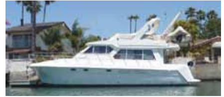
44' Navigator Classic '05. 210 hrs. on 310hp Volvo diesels. Bow thruster, AC. Shows as new. Bank wants it sold. $299,900. At FCY docks.