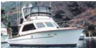
40' Egg Harbor. Beautiful! Twin 450hp 671TI Detroit's, new generator, AC, 2 strms. 3 boat owner wants it sold! $89,900.