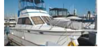
33' Egg Harbor '91. Twin 454's, low hours, genset, A/C, ready to fish! $62,500.