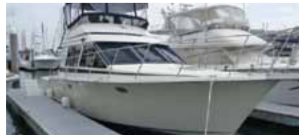
40' Tollycraft '89. New 330 Cummins in '99 - 690 hrs. New 8kw genset in '99. Asking $199,000.