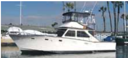
44' Pacifica SF '77. 8V71TI's, newer generator with 10 hrs. Fast, well built & nice. Reduced $50K to $219,000.