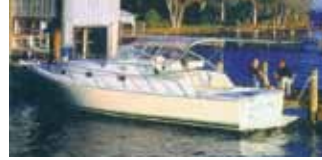
34' Mainship '03. Only 60 hrs. on 370hp Yanmar diesel. Bow thruster, AC, full electronics. Like new. $159,000.