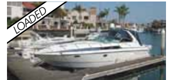
42' Bayliner 4085 Avanti Sunbridge Express '98. Under 500 original hrs. Full trionics, gen., air, dinghy davit, Caribe. Near bristol condition. Owner wants offers! Asking $78,000.