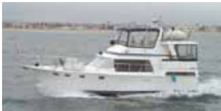
42' Lien Hwa '87. 240hp Perkins. Loaded and ready to cruise or liveaboard. AC, watermaker, new batteries. Asking $184,500.