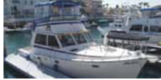
37' Gulfstream Ventura '87. Twin 250hp GM diesels, gen., watermaker, lots of equipment. Very economical. Priced to sell. $59,000.