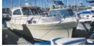
30' Mainship '04. Single 315hp Yanmar diesel, 200 hrs., AC/heat, 3kw generator, loaded. $119,000.